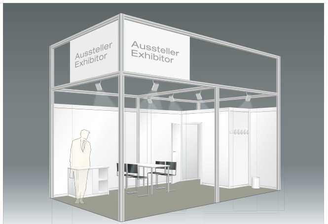
D2 Premium Package, 440.– EUR/m 2

The samples pictured here are available in either row or corner stand options.